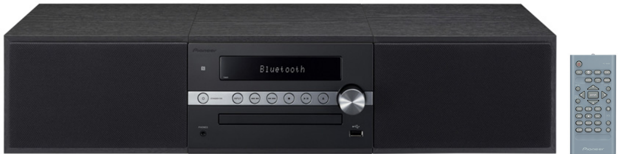
X-CM56B Horizontal speaker setup

Listen to CDs, FM/AM radio, and audio files via USB, as well as music streamed by Bluetooth® Wireless Technology. What's more, the NFC feature provides one-touch pairing with compatible devices such as smartphones. The stylish woodgrain (X-CM56B model only) design goes well with any room décor, with speakers allowing vertical or horizontal placement.