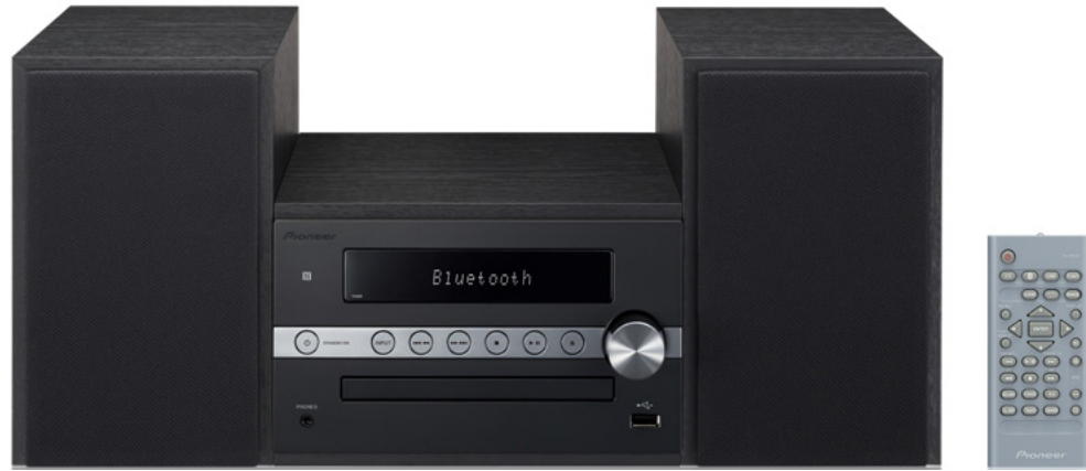
X-CM56B Vertical speaker setup