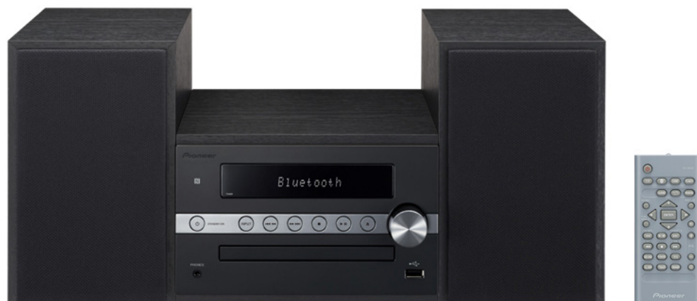
X-CM56B Vertical speaker setup