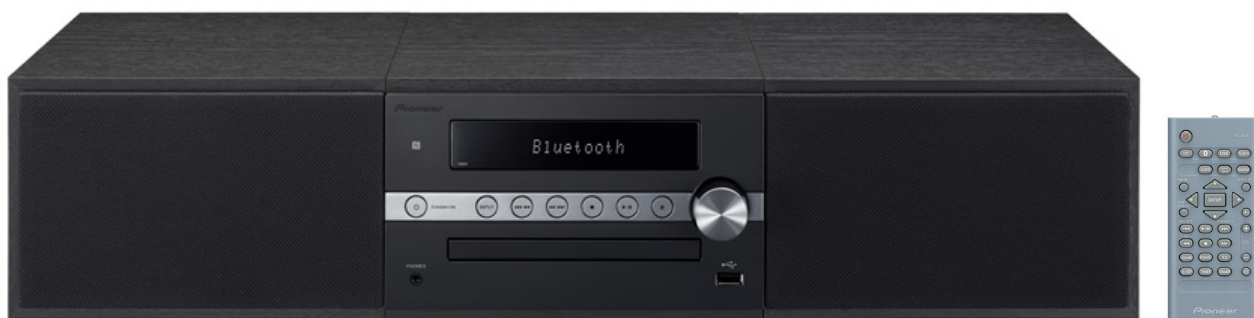
X-CM56B Horizontal speaker setup

Listen to CDs, FM/AM radio, and audio files via USB, as well as music streamed by Bluetooth® Wireless Technology. What's more, the NFC feature provides one-touch pairing with compatible devices such as smartphones. The stylish woodgrain (X-CM56B model only) design goes well with any room décor, with speakers allowing vertical or horizontal placement.