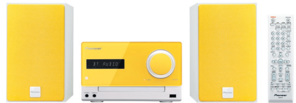
X-CM35-Y/CMP (Lemon Yellow)