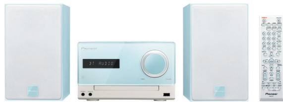
X-CM35-L/CMP (Light Blue)