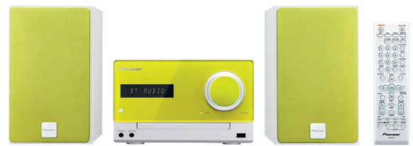
X-CM35-N/CMP (Lime Green)