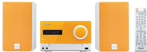
X-CM35-D/CMP (Passion Orange)